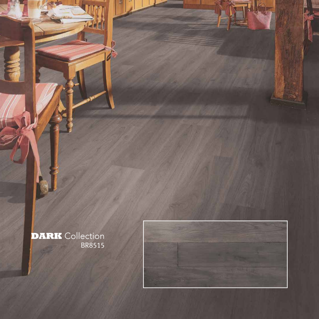
DARK Collection BR8515