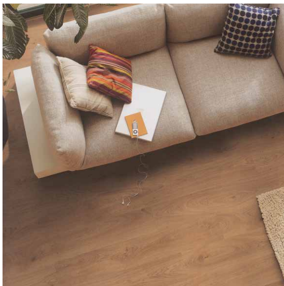
DARK Collection 3541