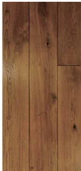
DARK Collection 3516