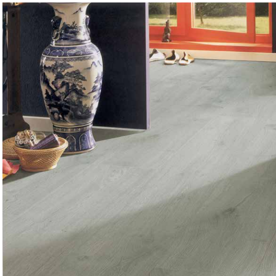
DARK Collection 3181