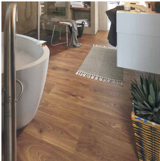
DARK Collection 3564