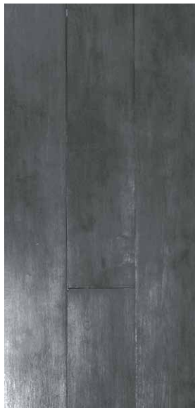
DARK Collection 3170