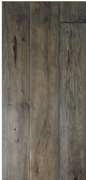
DARK Collection 3118